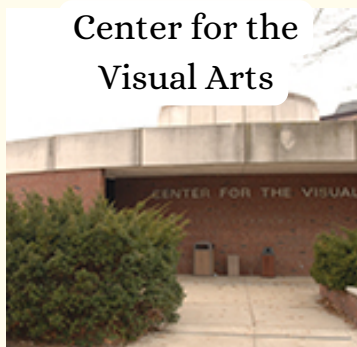
Center for the Visual Arts