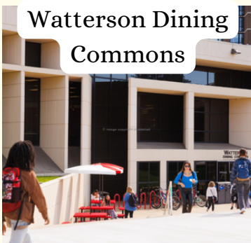
Watterson Dining Commons