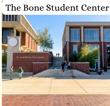
The Bone Student Center

200 N. University Street Normal, IL 61761