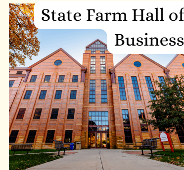
State Farm Hall of Business

410 S. University Street Normal, IL 61761