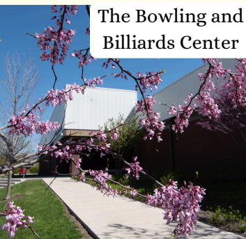
The Bowling and Billiards Center

347 S. University Street Normal, IL 61761