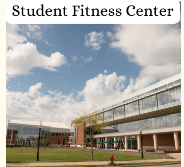
Student Fitness Center

347 S. University Street Normal, IL 61761